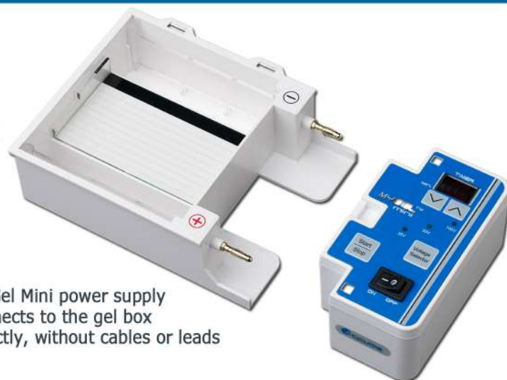
myGel Mini power supply connects to the gel box directly, without cables or leads