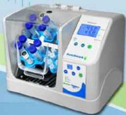
Roto-THERM™ Incubated Rotator Series