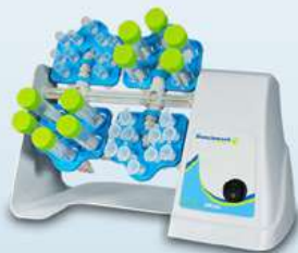
Roto-Mini™ Rotator Series