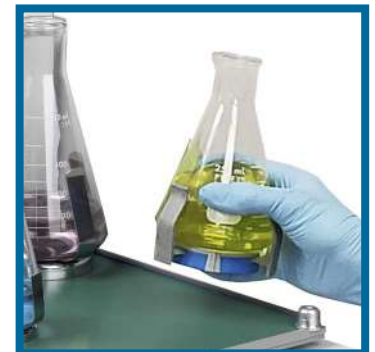
MAGic Clamp Platform H1000-MR with Adjustable MAGIC Clamp (H1000-MR-CMB)